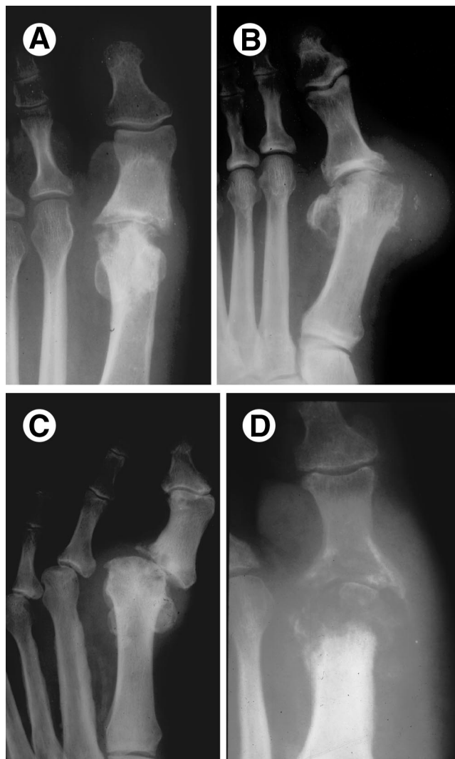
FIGURE 1 Radiographic evaluation is often useful in the diagnosis of a variety of other first MTP joint disorders. These may include a diverse group of acute to chronic pathology, including (A) avascular necrosis, (B) gout, (C) neuropathic arthropathy, and (D) osteomyelitis.